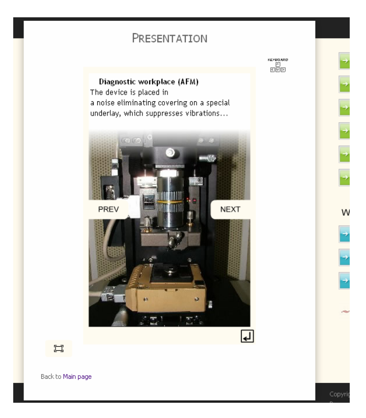
Figure 3. Photo of diagnostic workplace (AFM) in interactive flash presentation in Virtual tours of Optoelectronics laboratories

The location map of the department section is designed in flash, too. It loops zoom-in animation of the map that can be stopped/resumed, zoomed-in/zoomed-out, and observed by user. The map helps students to easily find the location.