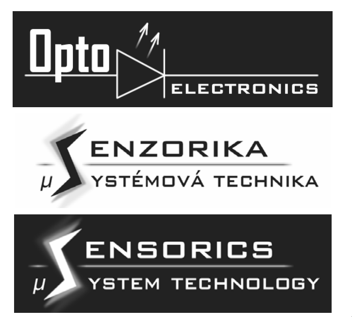
Figure 4. Logos for Virtual tour of Optoelectronics in English, Virtual tour of Sensorics in Slovak and Virtual tour of Sensorics in English

These processes were captured by camera and afterwards edited and cut in Sony Vegas Pro [7] video software. Final video footages were exported for web video flash player.