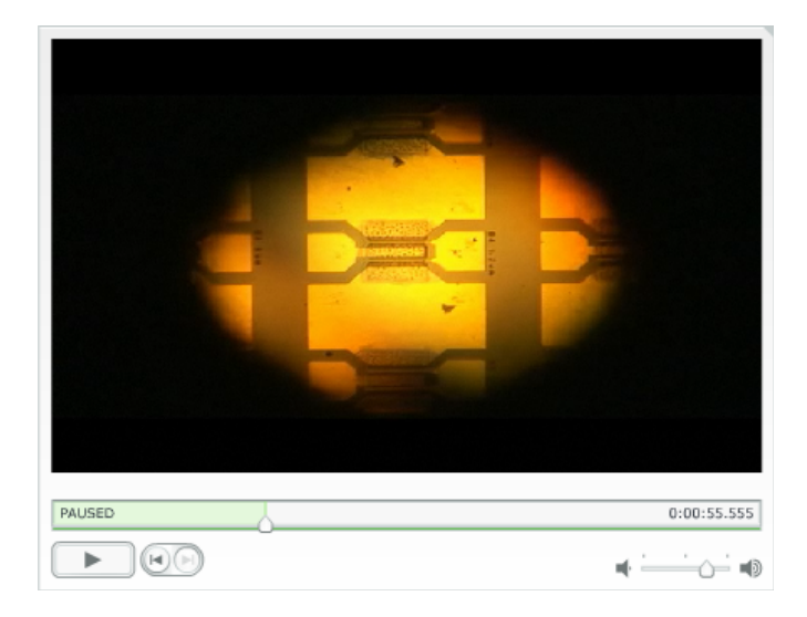
Figure 5. Video clip about measurement of S parameters

Video clips are addressed to laity, so that they can understand what optoelectronics or sensorics is in practice. Short video footage is supplemented with an audio commentary and a short article below the video.