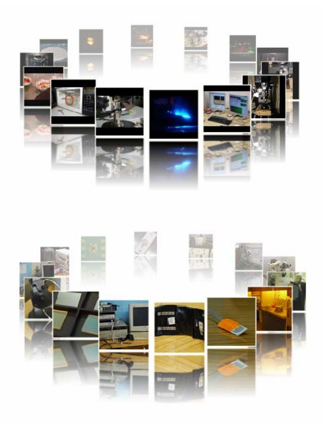
Figure 2. Interactive flash presentation in Virtual tours

Students usually search sections that provide as much information as possible in the shortest time. That's why the virtual tour students' production team decided to create a flash [6] based photo gallery. Photos from all laboratories were ment to help students to get an idea what is done in the laboratories (Fig. 2 and Fig.3).