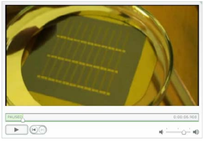
Figure 6. Video clip about thin layers preparation