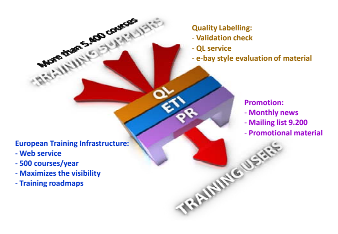
Figure 1. Course delivery from suppliers to users

Since the start in 1995 of the preceding EuroTraining project 5.400 courses have entered into the web service and more than 1.2 mio. training users have accessed the service in order to find the right training. The general rationale of the project is shown in the below figure: