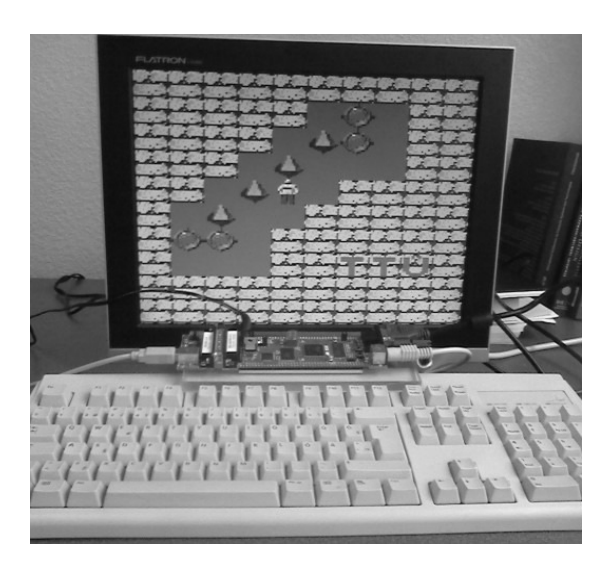
Figure 1. Apparatus setup.

The PS/2 keyboard controller accepts the data sent by the input device, extracts the key information, encodes it for convenient processing and sends an interrupt to the processing unit. Figure 1 illustrates the apparatus setup – the development board in the centre, the VGA screen and the keyboard.